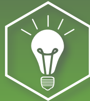
CREATIVITY & INNOVATION

Your ability to imagine, develop, express, encourage, and apply ideas in ways that are novel, unexpected, or challenge existing methods and norms. For example, we use this skill to discover better ways of doing things, develop new products, and deliver services in a new way.